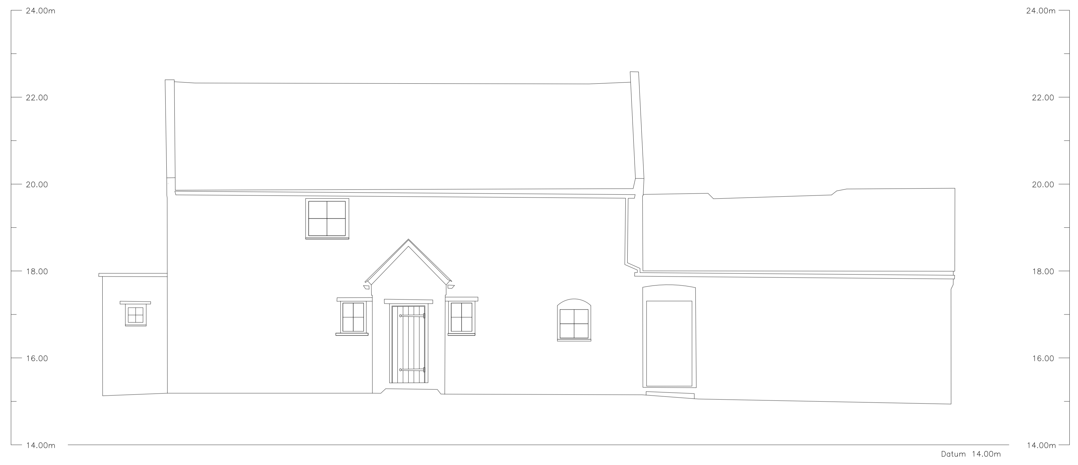
EXISTING ELEVATION 01

Do not scale from this drawing Drawing to be read in conjunction with the specification document Contractor to check all dimensions on site and notify Vincent and Brown of any discrepancies prior to commencement of the works