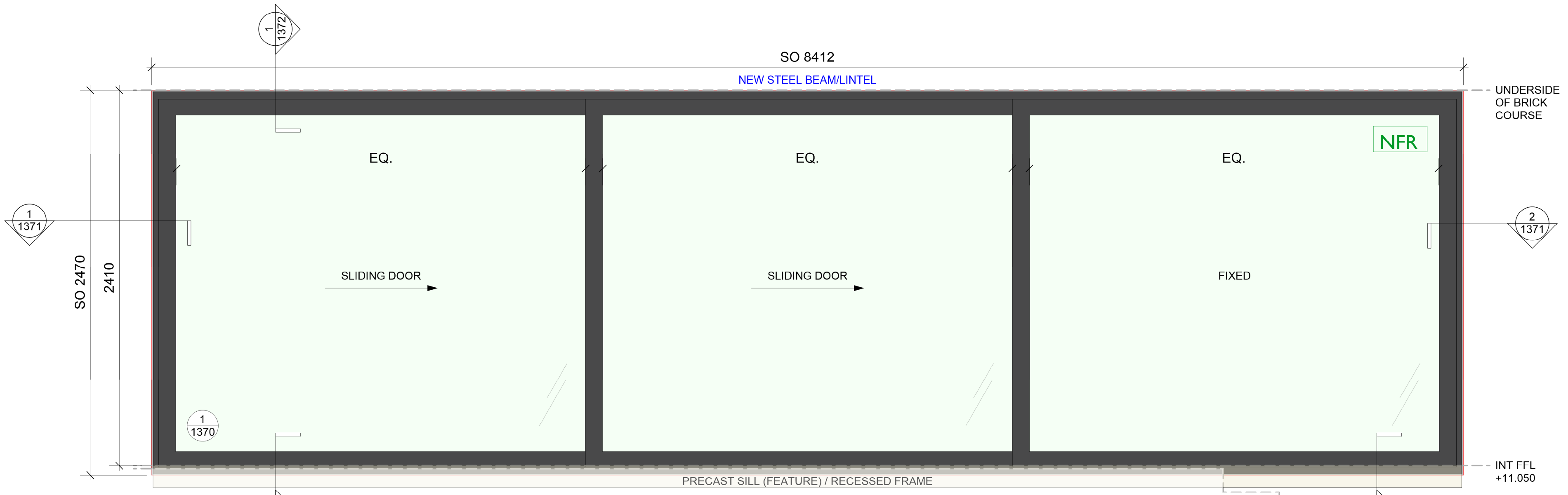
D1 (G.R.01) Door TYPE 11 - Triple sliding doors SAS PURe SLIDE, Triple Track HD Lift & Slide as L20/520 DEFLECTION LIMIT: 2MM

NOTE: EI 30 30 MINS FIRE INTEGRITY AND INSULATION EI 60 60 MINS FIRE INTEGRITY AND INSULATION NFR NOT FIRE RATED