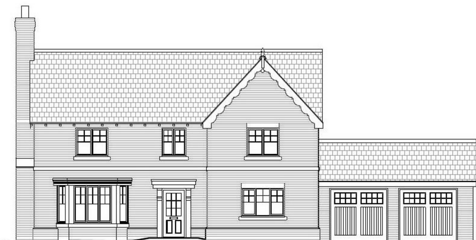
FRONT ELEVATION - House Type 7