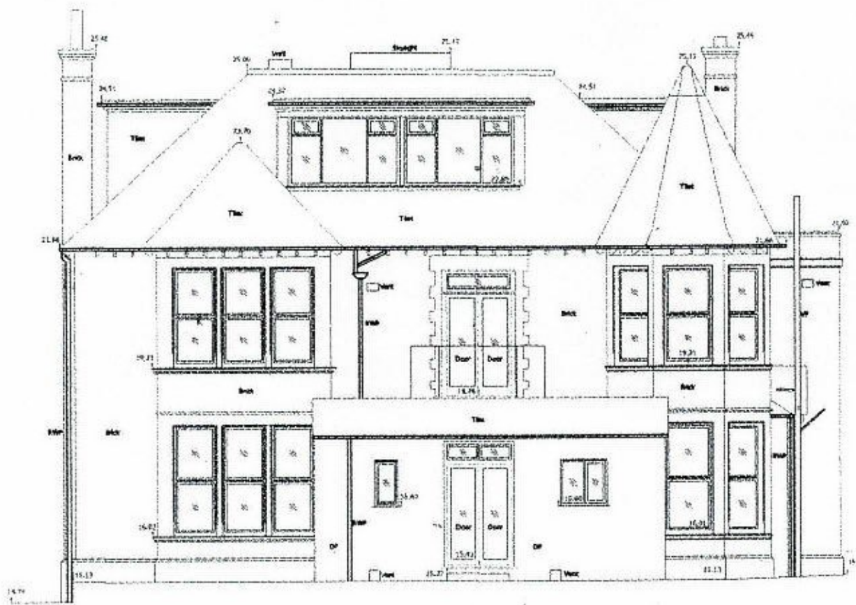
SIDE ELEVATION – West