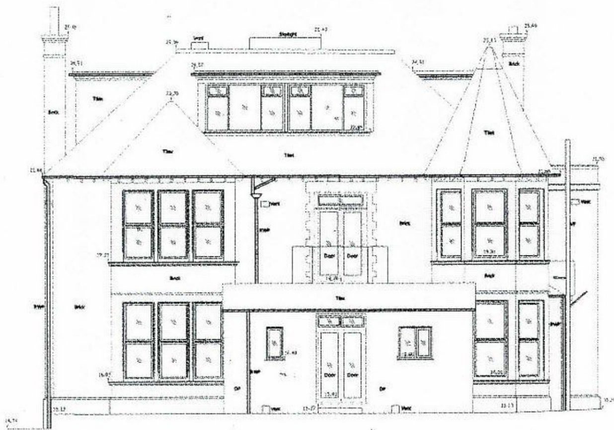
SIDE ELEVATION - West