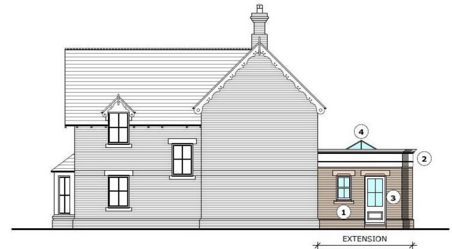
SIDE ELEVATION TO DRIVEWAY