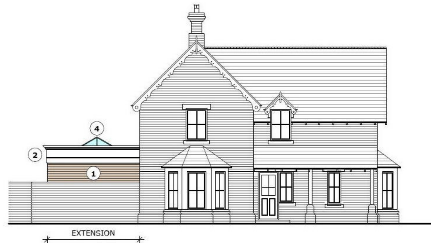
SIDE ELEVATION TO SCHOOL LANE