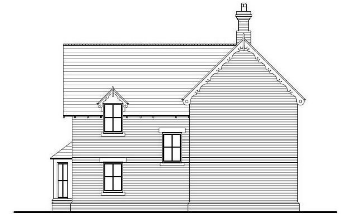
SIDE ELEVATION TO DRIVEWAY