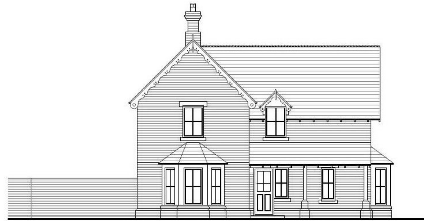
SIDE ELEVATION TO SCHOOL LANE