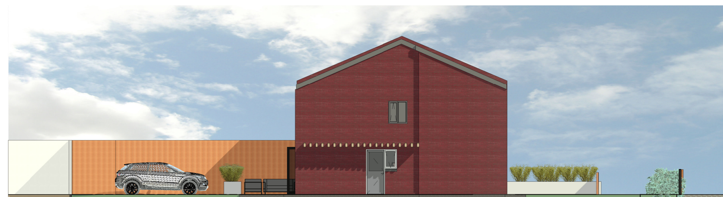
5 West Elevation 1 : 100