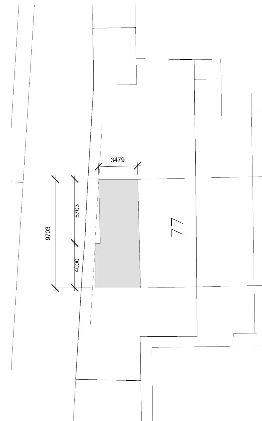
7 04 - Block Plan 1 : 200 0m 4m 8m 12m 16m 20m VISUAL SCALE 1:200 @ A1