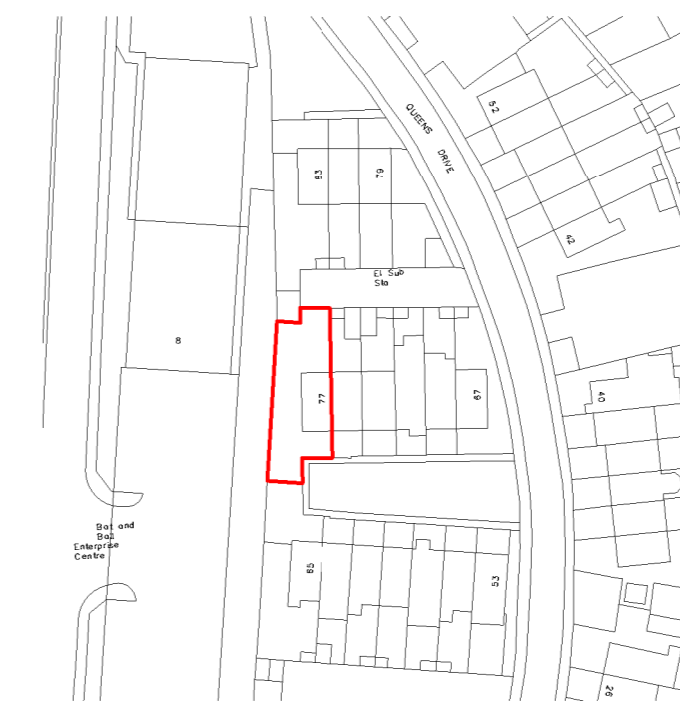
6 03 - Site Location Plan 1 : 1250 0m 25m 50m 75m 100m 125m VISUAL SCALE 1:1250 @ A1