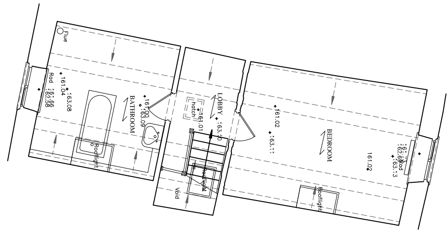
Second Floor Plan - 1:100 @ A3