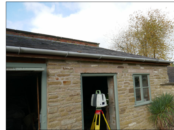
38 Remove existing garage roof to build new double pitched roof to accommodate Media Room.

Notes This drawing is the copyright of Giles Quarme Architects and cannot be printed or reproduced without prior permission. This drawing has been based on survey information provided by others. All dimensions and setting out must be verified on site before commencement of the work, and any discrepancies notified to the architect. All windows and doors are to fit into existing openings unless stated otherwise. All dimensions are in millimetres unless stated otherwise.