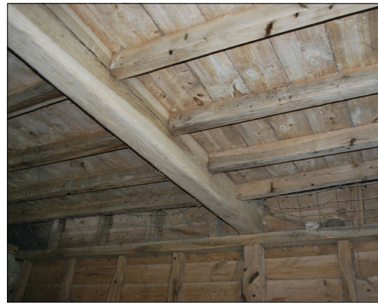
24 Rebuild modern timber floor.