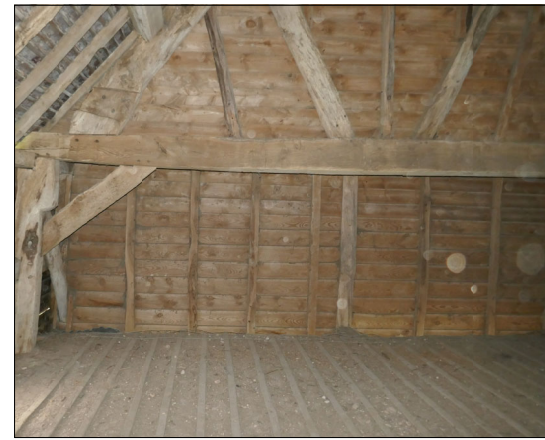
25 Remove modern timber boarding.