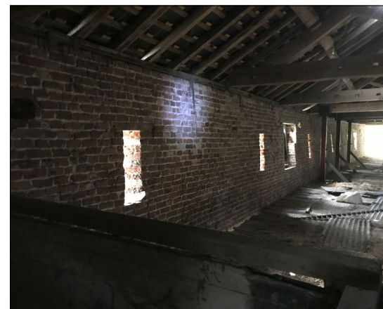
33 Remove timber partitioning.