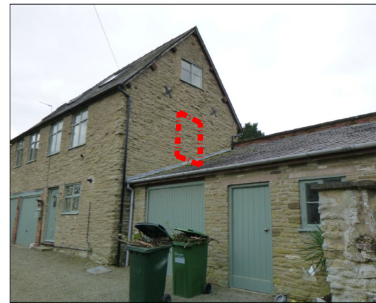
37 New opening to connect Coach House & proposed new Media Room.