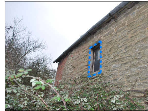
30 Rediscover existing window.