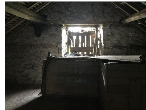
34 Remove timber partitioning.