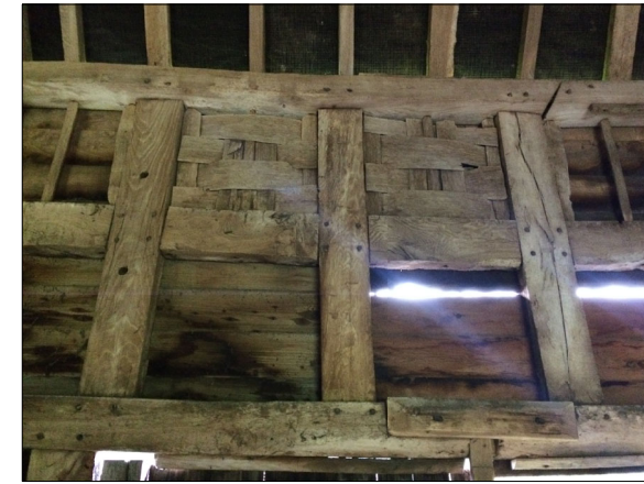
26 Remove modern timber boarding to reinstate woven panels within the existing timber framing.