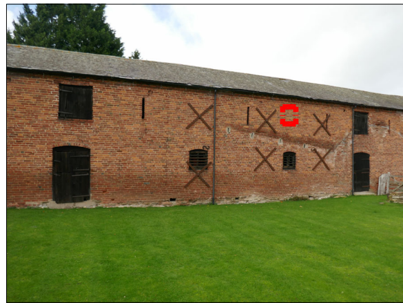
35 Proposed new opening matching adjacent to increase natural lighting.