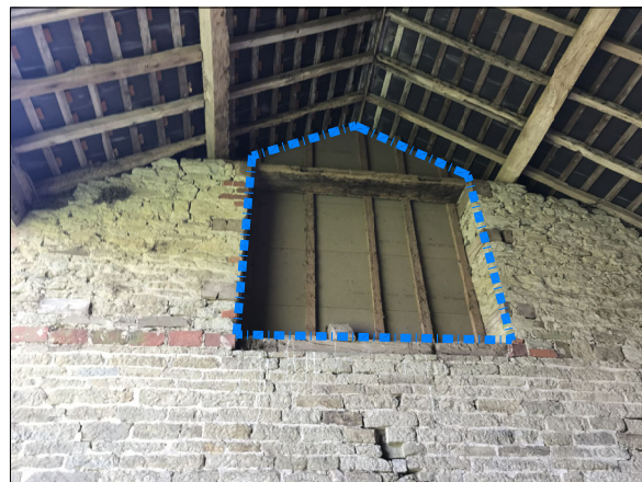
31 Remove modern lining to rediscover existing opening to be provided with new glazed joinery.