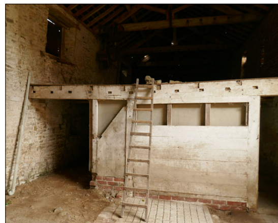
32 Remove section of existing floor to install new staircase to access loft.