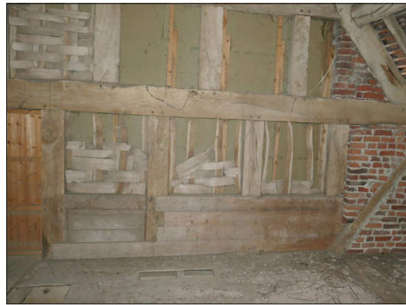
27 Remove modern lining to rediscover main truss & reinstate woven panels within the existing timber framing.