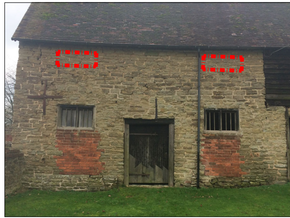
23 Proposed new openings to 1st floor.