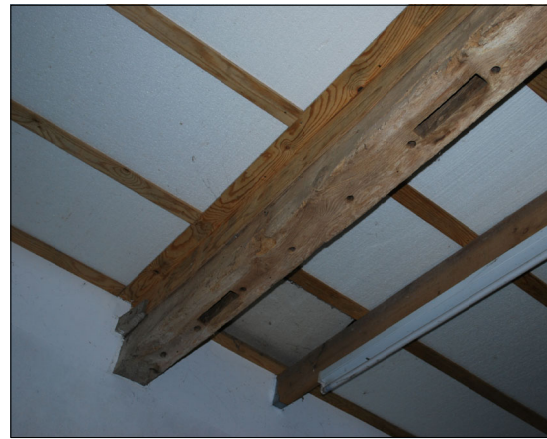
28 Remove modern false ceiling to rediscover double height and visible main trusses.