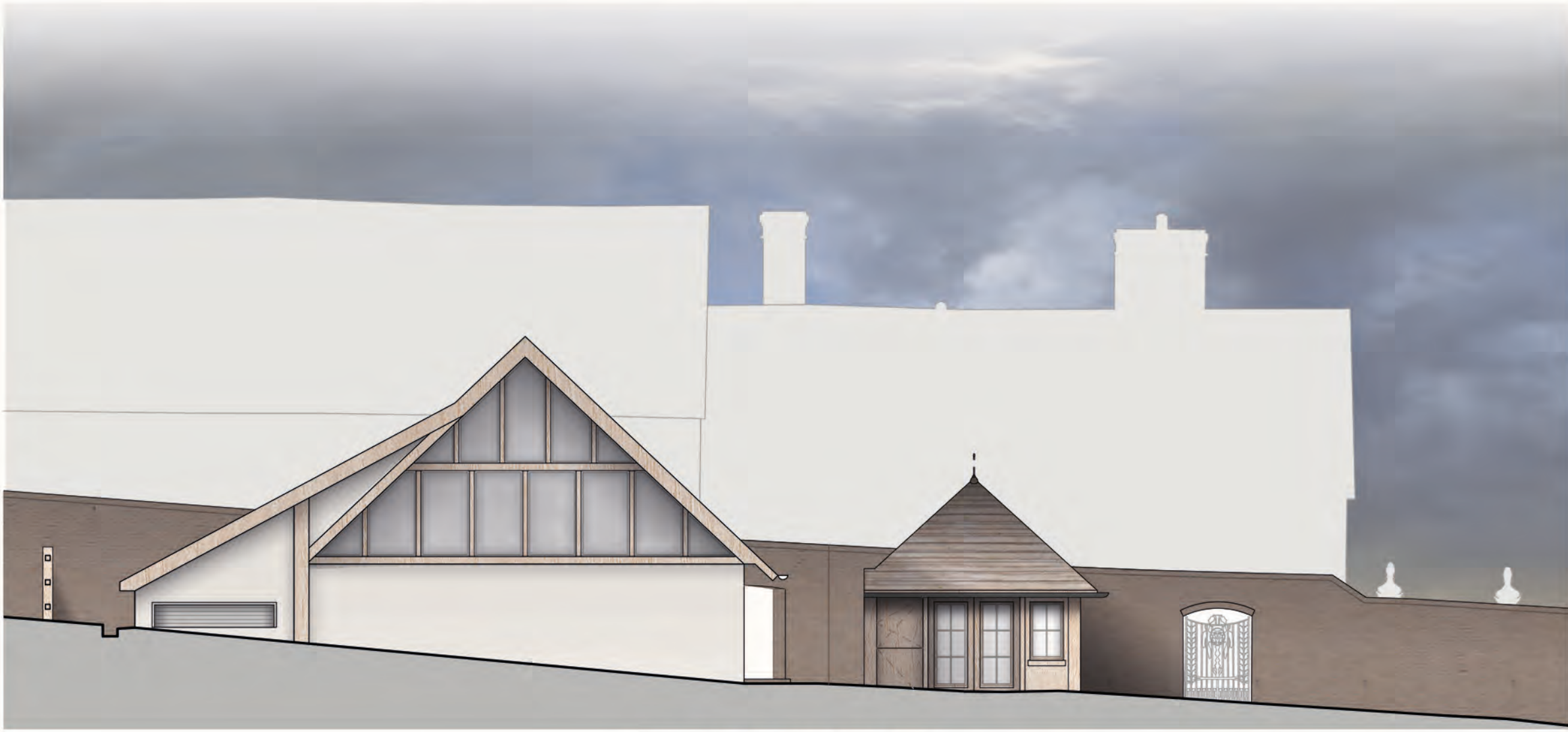
Proposed Pool Building - South Elevation PROPOSED - 1:100 @ A3