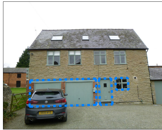
17 Reconfigure openings to create accessible accommodation at GF.