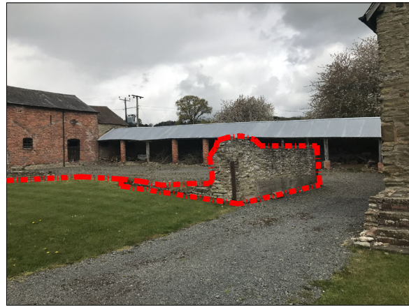
16 Remove traces of Dutch barn & re-landscape courtyard.