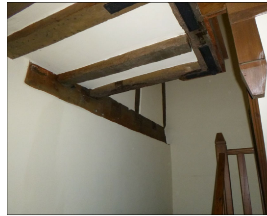
18 Remove staircase to 1st floor to create accessible accommodation at GF.