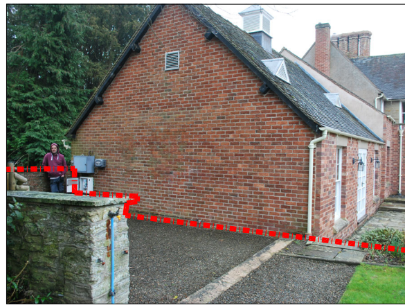
22 Re-landscape area next to modern kitchen extension to improve circulation & parking.

Notes This drawing is the copyright of Giles Quarme Architects and cannot be printed or reproduced without prior permission. This drawing has been based on survey information provided by others. All dimensions and setting out must be verified on site before commencement of the work, and any discrepancies notified to the architect. All windows and doors are to fit into existing openings unless stated otherwise. All dimensions are in millimetres unless stated otherwise.