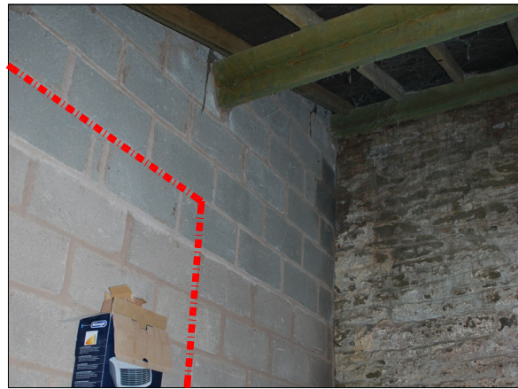
19 Create new opening through blockwork diving Coach House & garage.