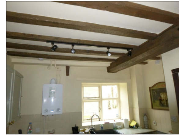
18 Remove internal partition and strip out kitchen to create accessible accommodation at GF.