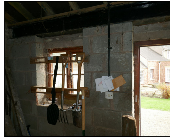
20 Rebuild stone & blockwork elevation to form Media Room.