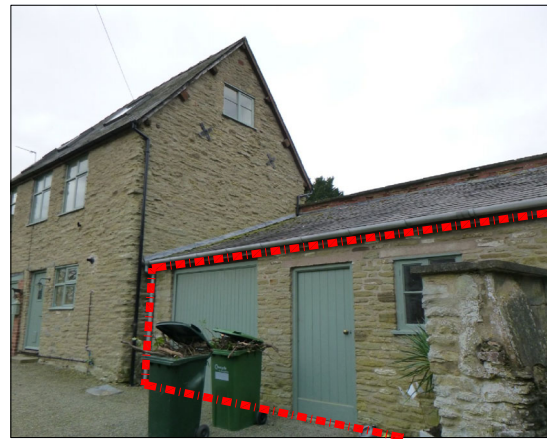
20 Rebuild stone & blockwork elevation to form Media Room.