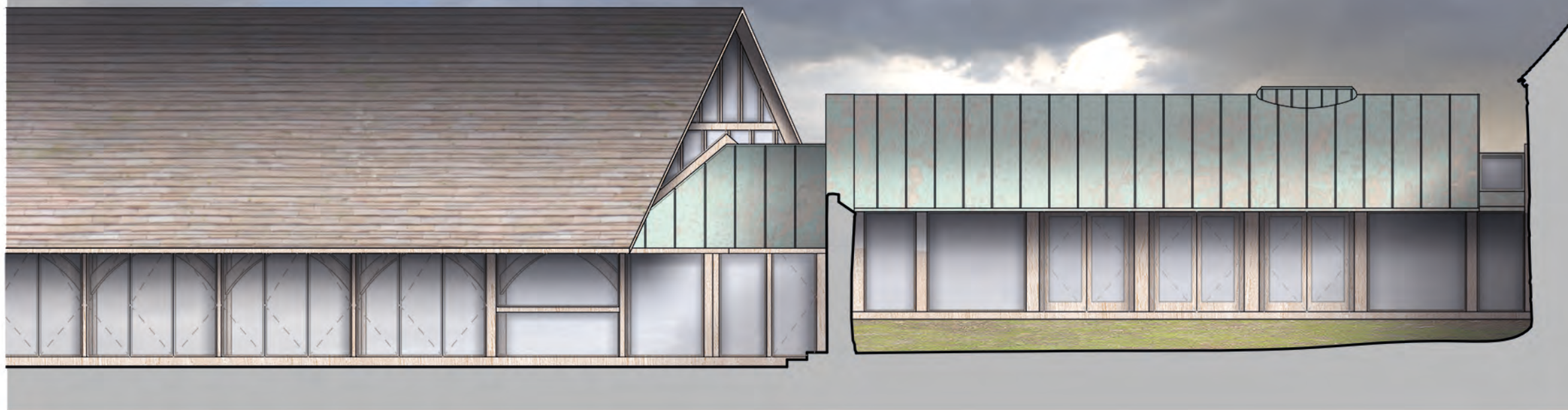
Proposed Link Building - East Elevation PROPOSED - 1:100 @ A3