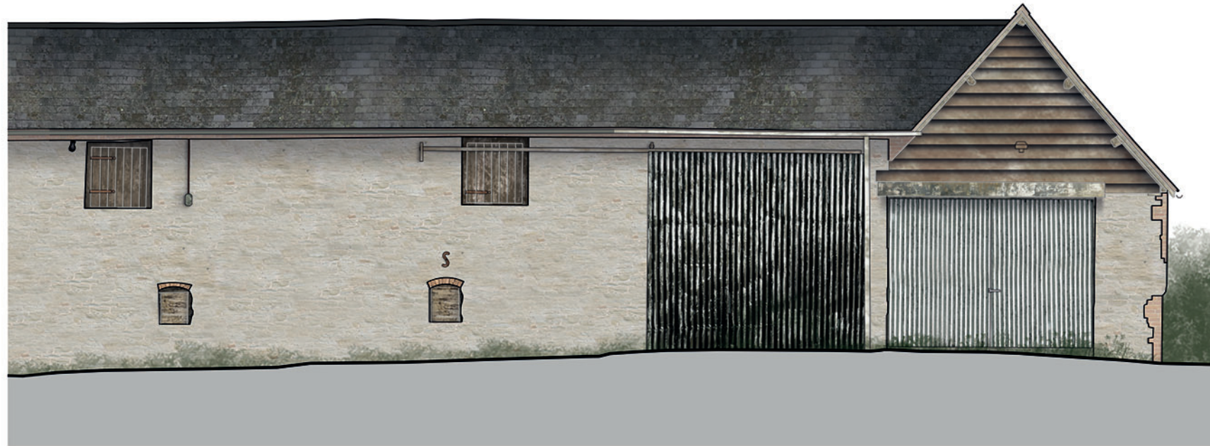
Existing West Elevation (Part I) 1:100 @ A3