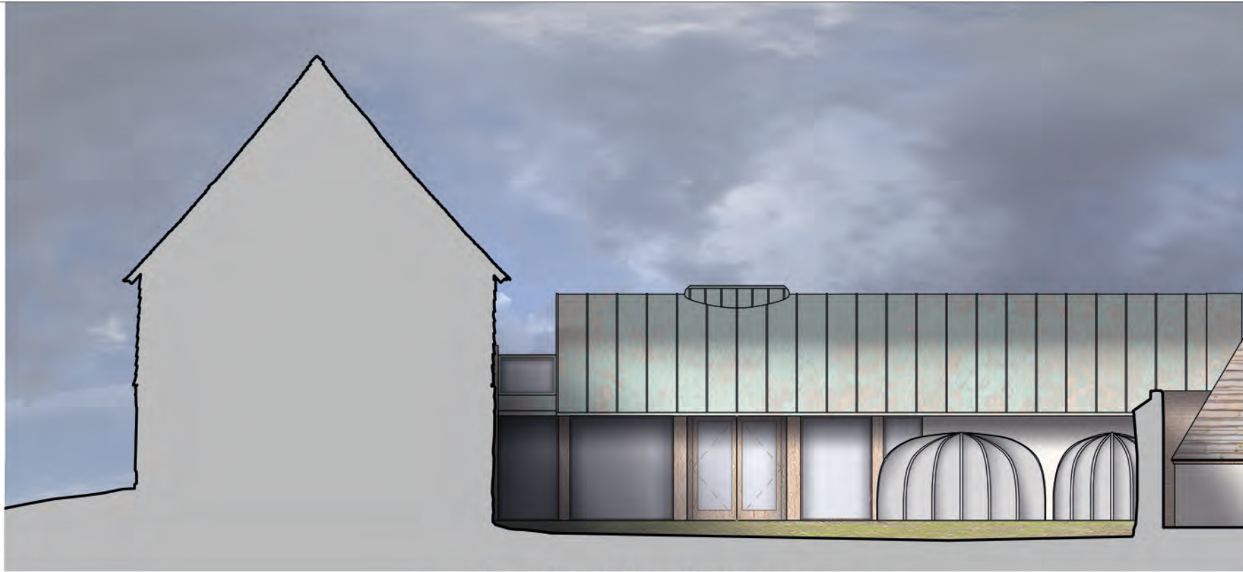
Proposed Link Building - West Elevation PROPOSED - 1:100 @ A3