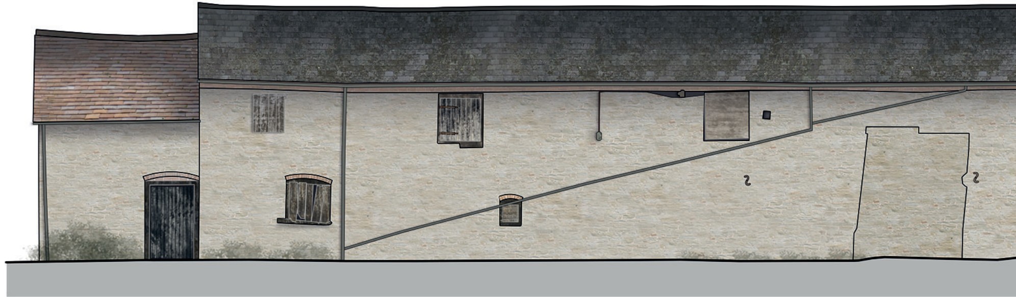
Proposed West Elevation (Part II) 1:100 @ A3