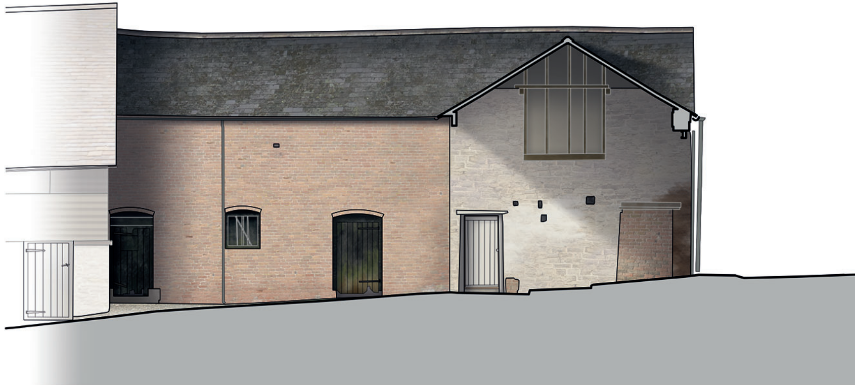
Existing North Elevation 1:100 @ A3