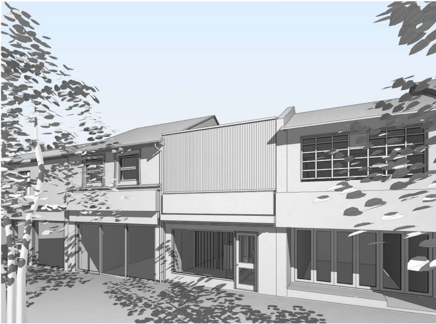
1 Existing 3D Front View