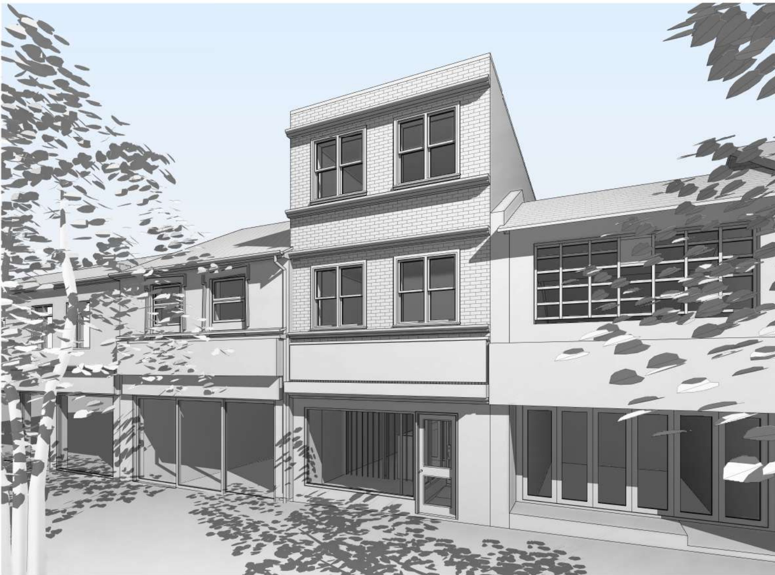
2 Proposed 3D Front View