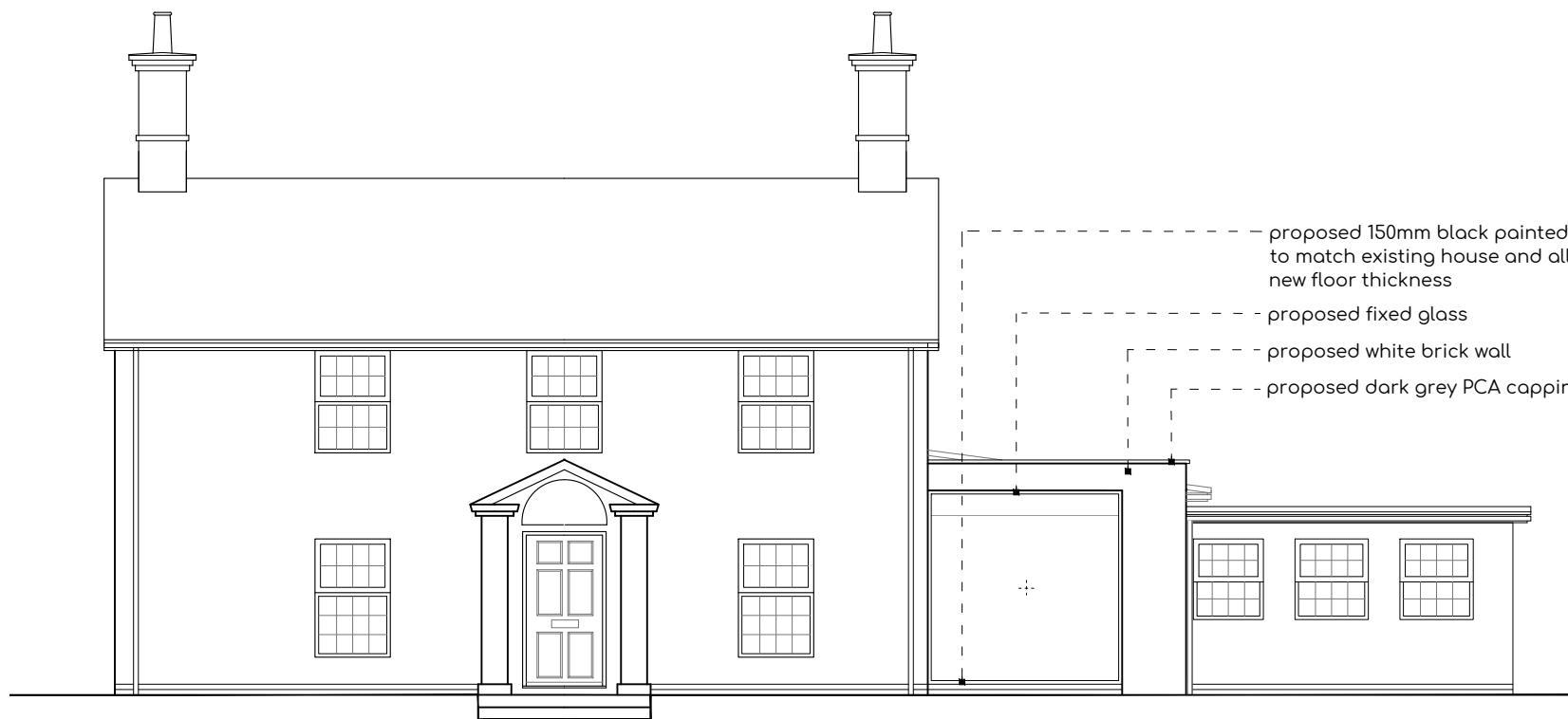
Proposed Front Elevation 1:100