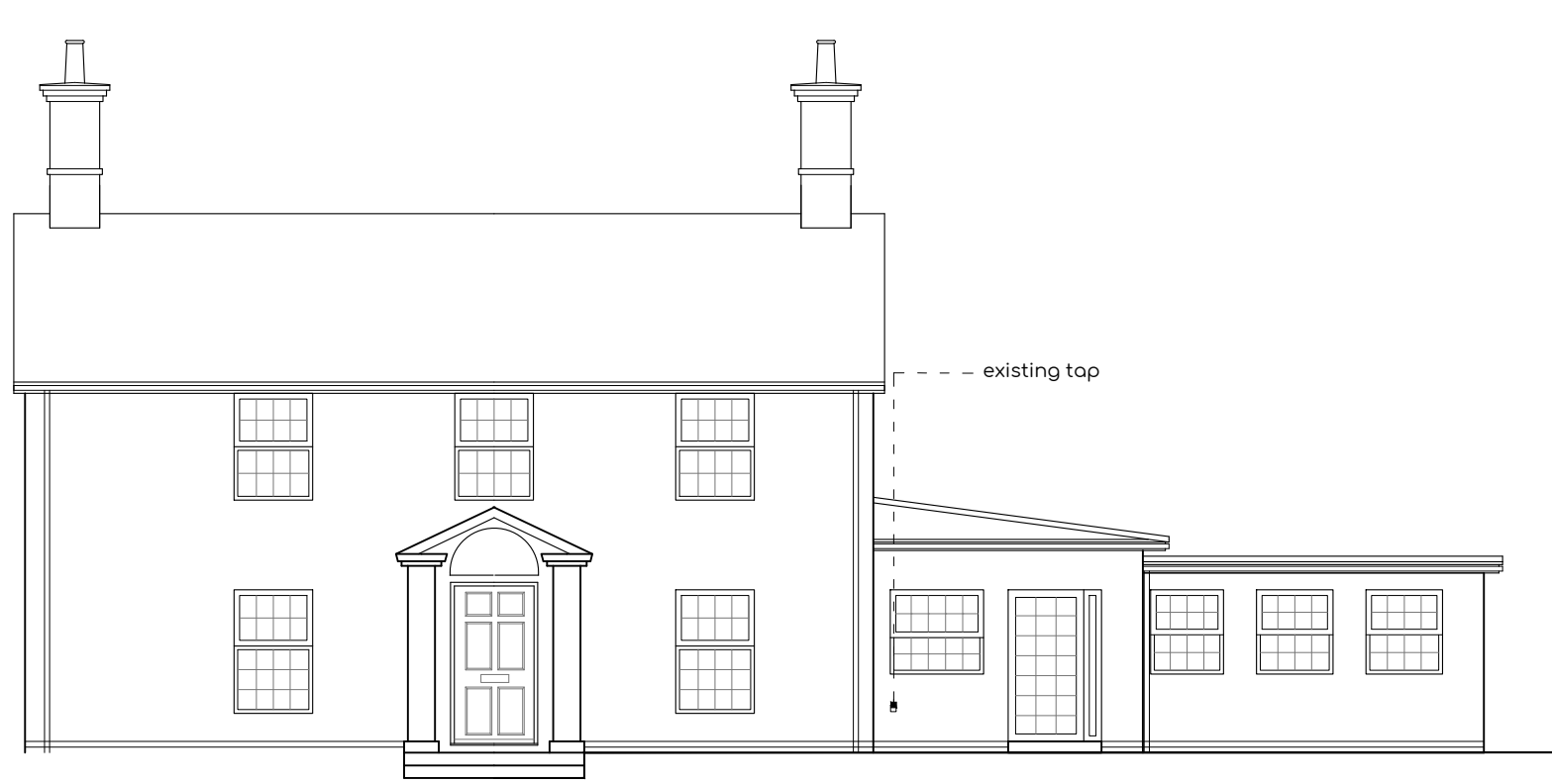
Existing Front Elevation 1:100