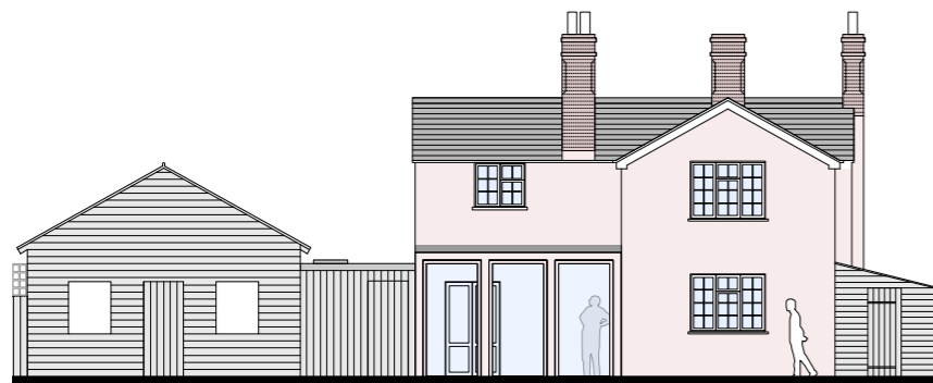
Proposed Garden Elevation

The proposed design seeks to remedy these deficiencies by partially demolishing the red-brick rear and removing the existing low-quality conservatory. These would be replaced with a larger glazed room, with masonry piers. The piers and existing brickwork elsewhere would be rendered and also painted Suffolk Pink.