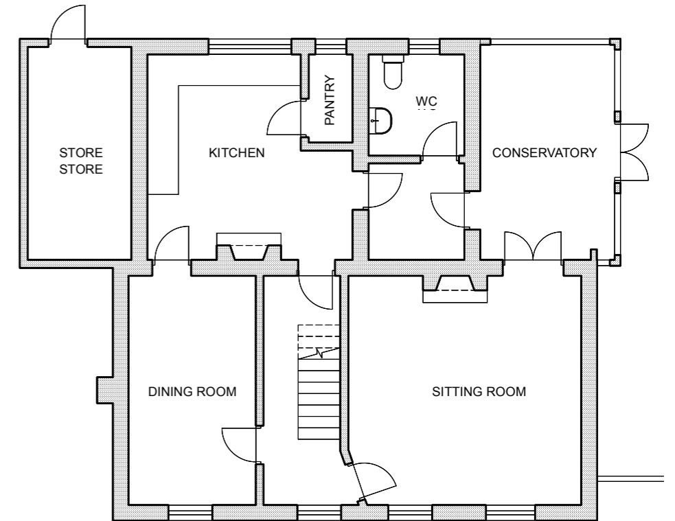
Existing Ground Floor Plan

The design is of high quality, and will enhance the original building. However, these changes will be not appreciable from the road, nor from the neighbours who are set substantially apart, and whose gardens are well screened.