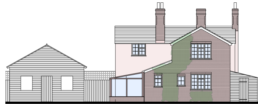
Existing Garden Elevation

The rear of the house is constructed more recently, in red brick, and is somewhat at odds with the front. Its internal spaces do not work well together, nor do they have a positive relationship with the large south-facing garden.