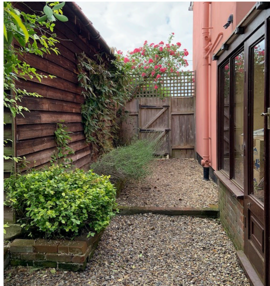
Space between existing garage and house