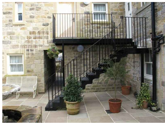
02 Staircase Precedent 2202 Balustrading

See individual notes for specific details for each item.