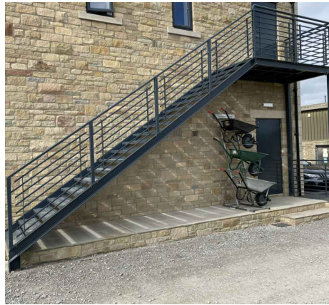
03 Staircase Precedent 2202 Treads