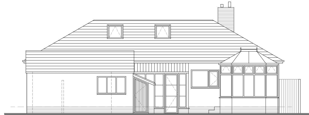
Existing North East Elevation scale 1:100

ALL DIMENSIONS AND LEVELS ARE TO BE CHECKED ON SITE ANY DISCREPANCIES ARE TO BE REPORTED TO THE ARCHITECT BEFORE ANY WORK COMMENCES THIS DRAWING SHALL NOT BE SCALED TO ASCERTAIN ANY DIMENSIONS WORK TO FIGURED DIMS ONLY THIS DRAWING SHALL NOT BE REPRODUCED WITHOUT EXPRESS WRITTEN PERMISSION FROM HUISDESIGN LTD. READ IN CONJUNCTION WITH ALL RELEVANT DRAWINGS, SPECIFICATIONS, CONSULTANTS, SPECIALISTS, SUBCONTRACTORS DRAWINGS/ SPECIFICATIONS. THESE DRAWINGS ARE FOR PLANNING AND BUILDING CONTROL PURPOSES ONLY. PARTY WALL ACT 1996. The Owner, should they need to do so under the requirements of the Party Wall Act 1996 has a duty to serve a party wall notice on any adjoining owner if the building works involves works on or to an existing Party Wall including: - Support beams - Insertion of DPC through wall - Raising of wall or cutting of projections - Demolition and rebuilding - Underpinning - Insertion of lead flashing - Excavation within 3M of an existing structure where the new foundations will go deeper than the adjoining foundations or within 6M of an existing structure where the new foundations are within a 45 degree line of adjoining foundations. A PARTY WALL AGREEMENT IS TO BE IN PLACE BEFORE ANY WORKS START ON SITE, IF REQUIRED. ASBESTOS PROPERTIES BUILT PRIOR TO 2000 SHOULD HAVE AN ASBESTOS SURVEY DONE PRIOR TO ANY WORK START ON SITE, IF REQUIRED.