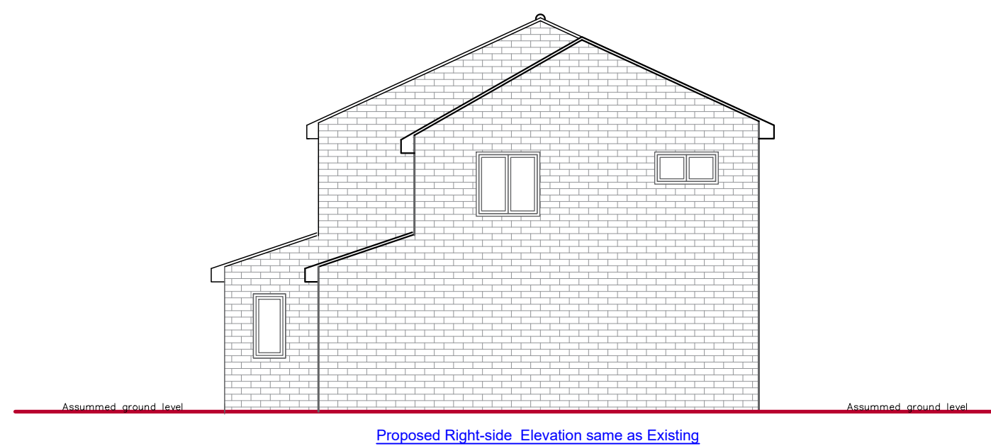
Proposed Right-side Elevation same as Existing