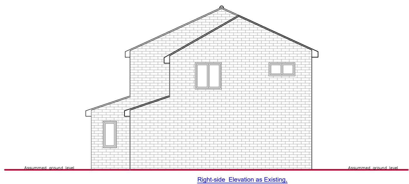
Right-side Elevation as Existing.