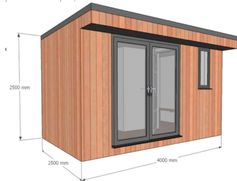
3D DIMENSIONED image to assist you - DO NOT SCALE