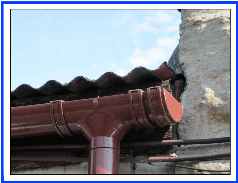
EXISTING EAVES IMAGE