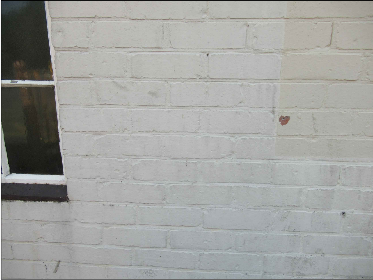
WALL BRICK BONDING IMAGE

RECLAIMED BRICK OUTER LEAF IN STRETCHER BOND PAINTED WHITE WITH FLUSH POINTED JOINTS MORTAR TO BE 1:1:6 CEMENT,LIME,SAND