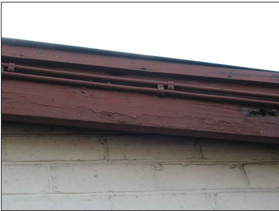
EXISTING VERGE IMAGE