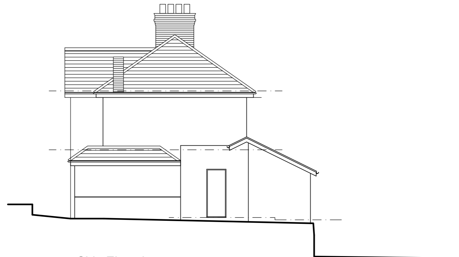
4. Side Elevation