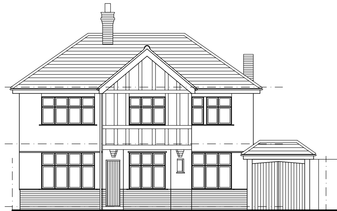
1. Front Elevation