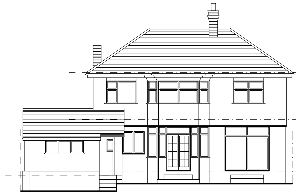
3. Rear Elevation