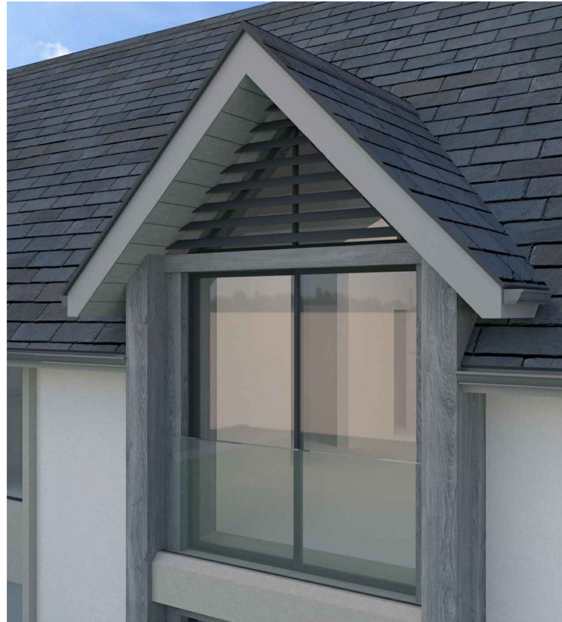
D.5 - Bay Window