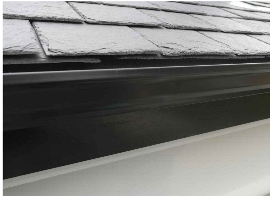
D.1 - Natural Blue Slate Roof - Black Aluminum R.W.G