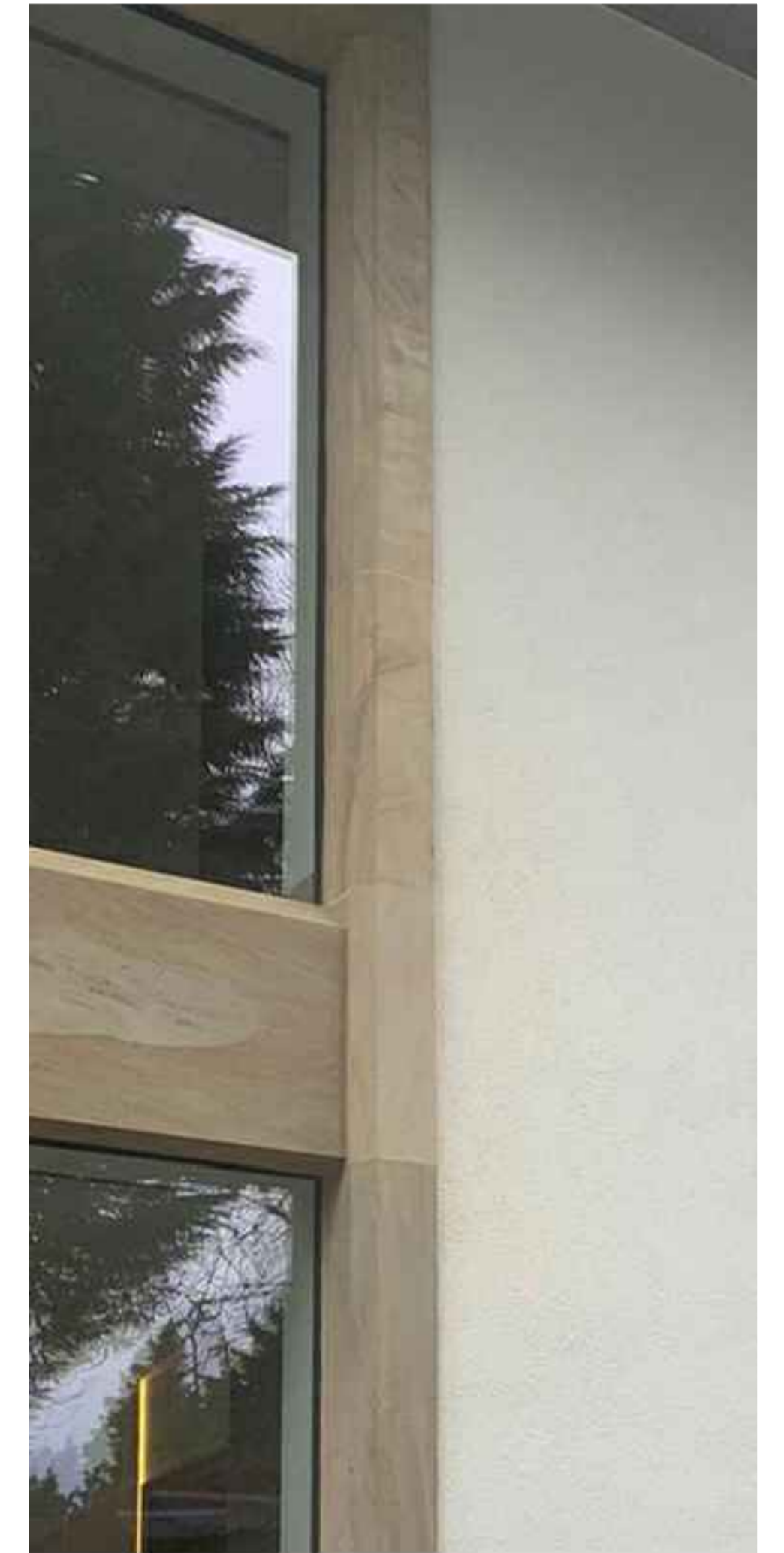
D.6 - Stone Window Surround & Framless Window Detail