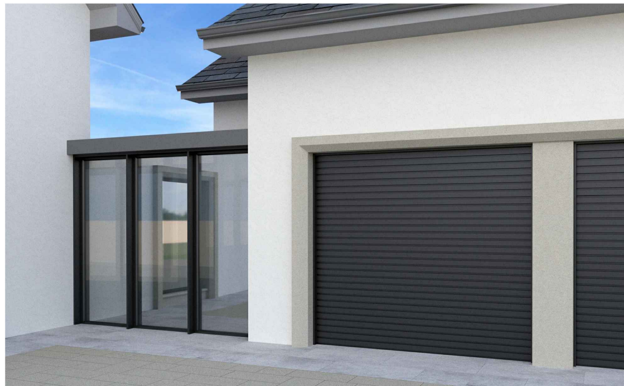
D.4 - Garage Door and Glazed Link