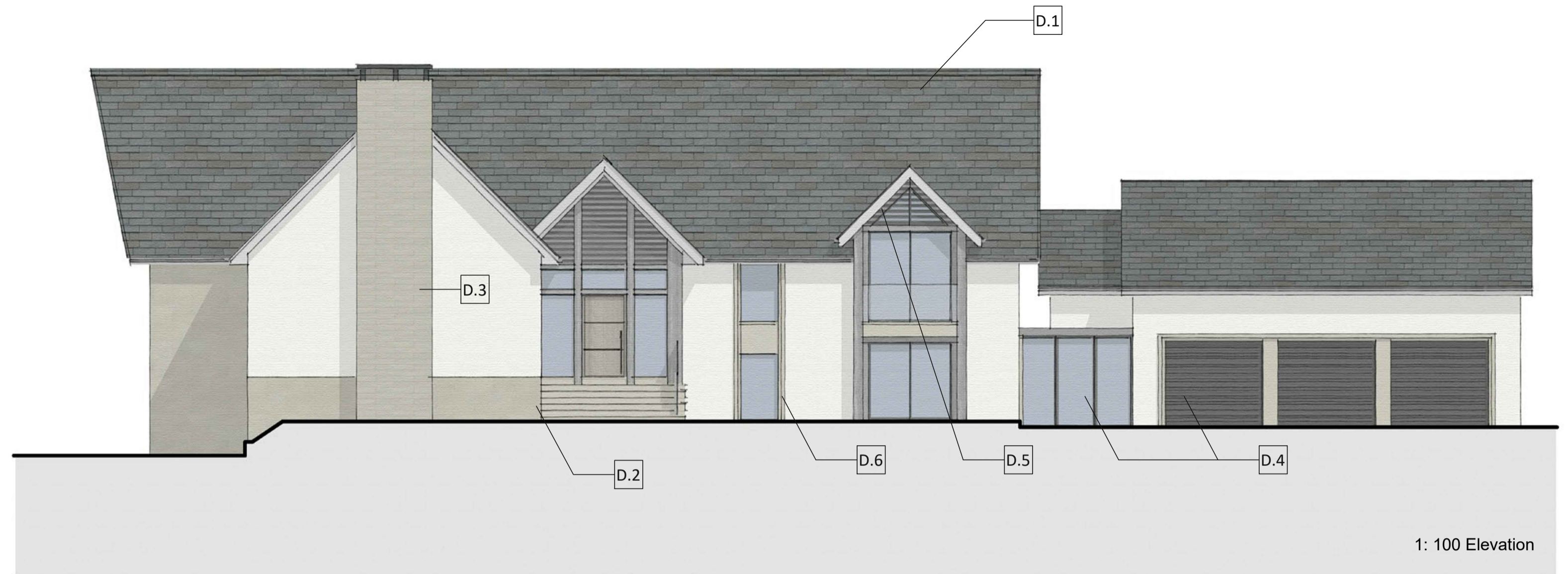
Front - South Elevation