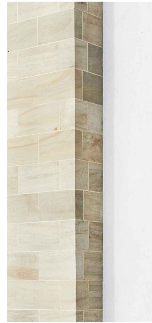
D.3 - Natural Stone Chimney Stack