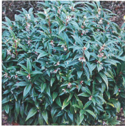
Sarcococca hookeriana 'Winter Gem' Will need replacing every 10 years. Evergreen shrub to 40-50cm H Flowers Jan / Feb