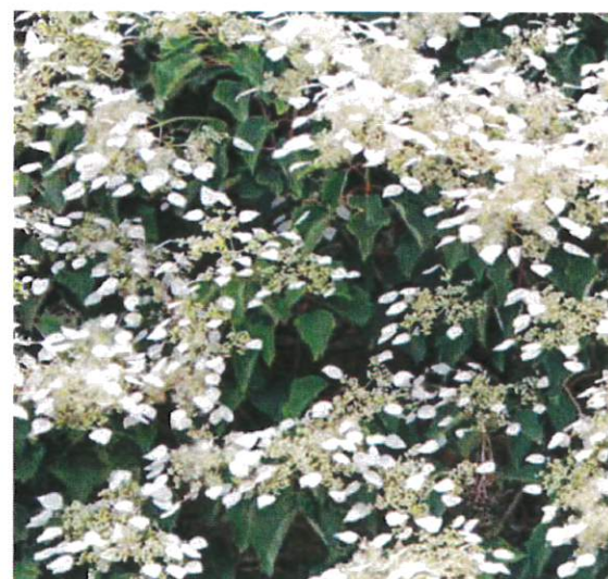
Hydrangea anomala subsp. petiolaris Self clinging deciduous climber to 8m H