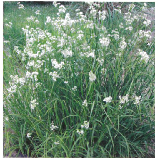
Luzula nivea Partial shade, wet or reasonably dry soils, but will take sun if not too dry. Height 50cm-60cm. Evergreen.