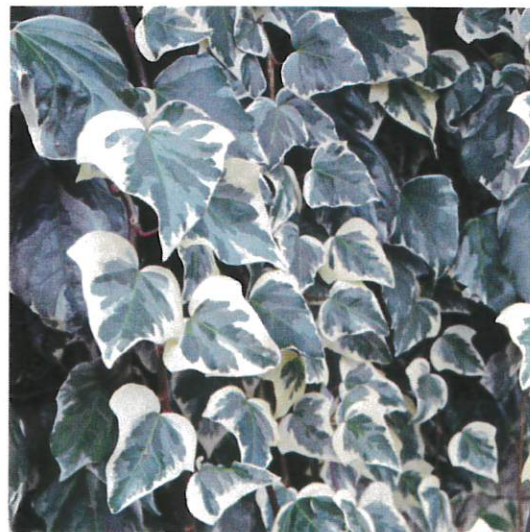
Hedera algeriensis 'Gloire de Marengo' Self clinging evergreen climber to 4m H