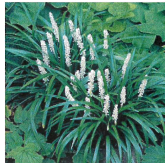
Liriope muscari 'Monroe White' Evergreen flowering perennial to 40cm H. Flowers Sept / Oct