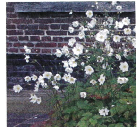
Anemone x hybrida 'Honorine Jobert' Will need replacing every 5 years. Herbaceous perennial to 80cm-1m H. Flowers July to Oct