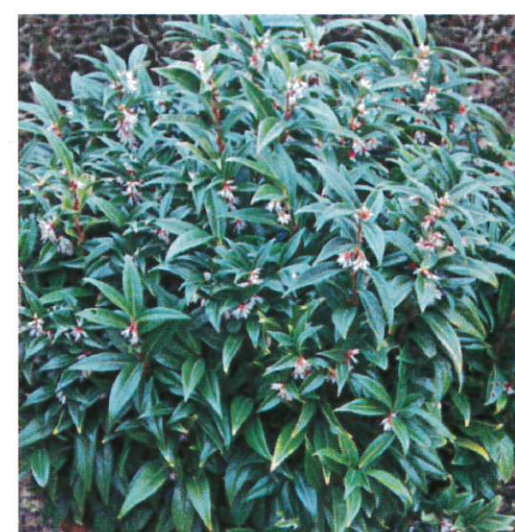
Sarcococca hookeriana 'Winter Gem' Will need replacing every 10 years. Evergreen shrub to 40-50cm H Flowers Jan / Feb