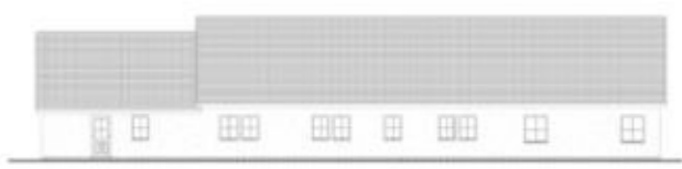
⑤ Rear Elevation 1:100