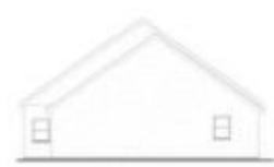
③ Garage Gable Elevation 1:100