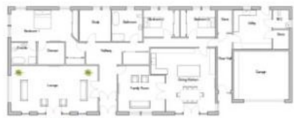
① Level 2 - GFL 1:100