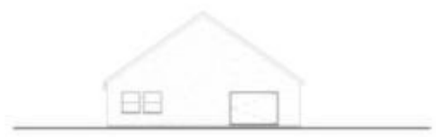
④ Lounge Gable Elevation 1:100