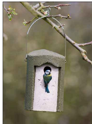
SCHWEGLER 1B NEST BOX