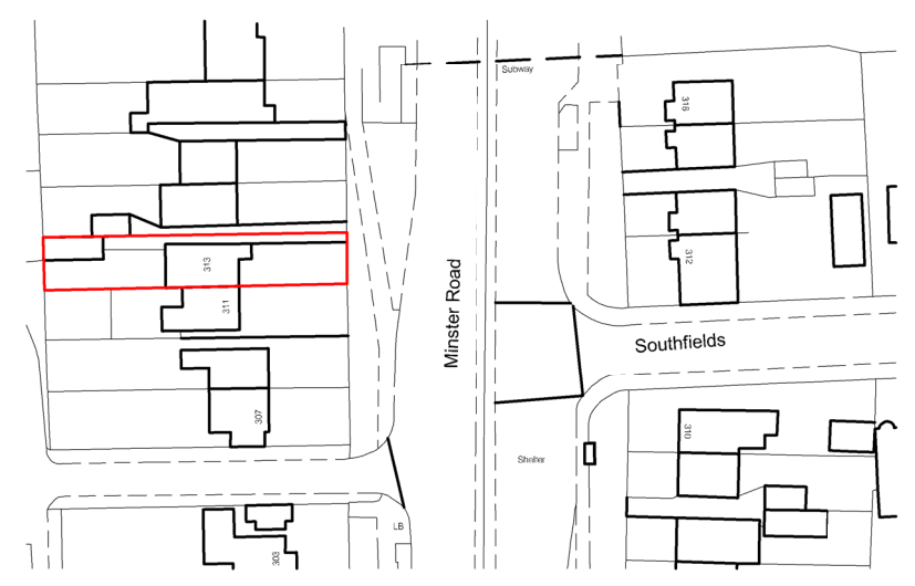
LOCATION PLAN 1 : 1250 @A3