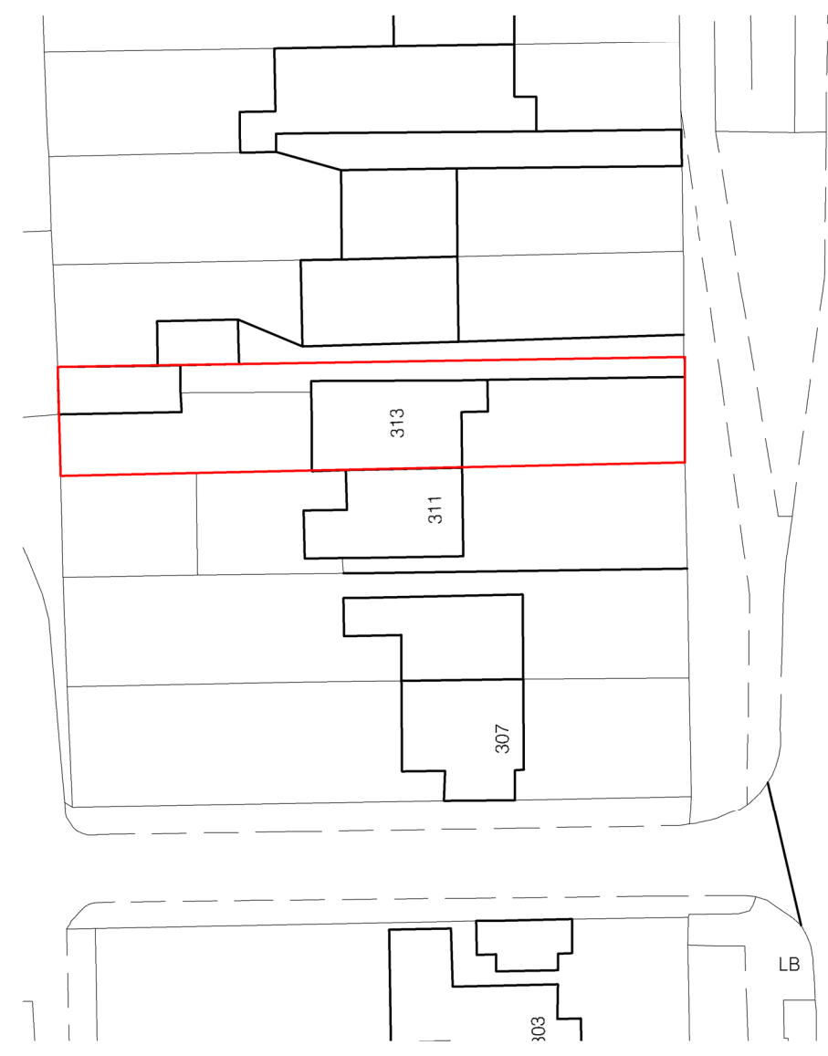
BLOCK PLAN 1 : 500 @A3