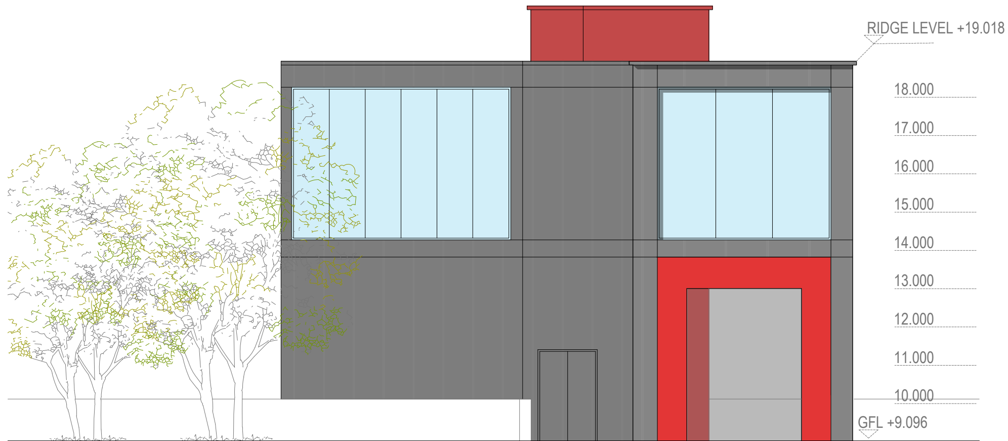
PROPOSED EAST ELEVATION 1:100