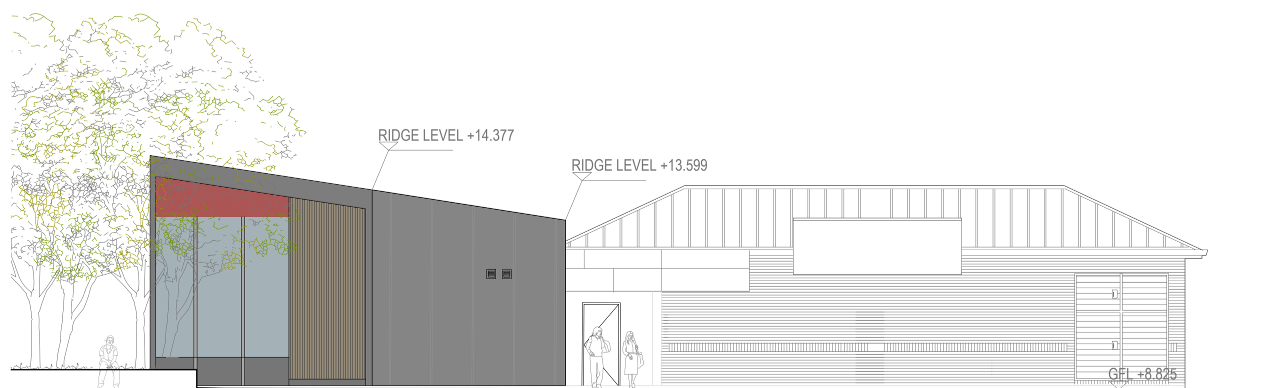
PROPOSED WEST ELEVATION 1:100