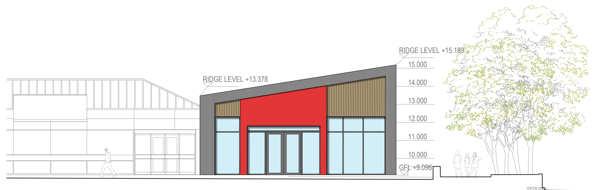
PROPOSED EAST ELEVATION 1:100