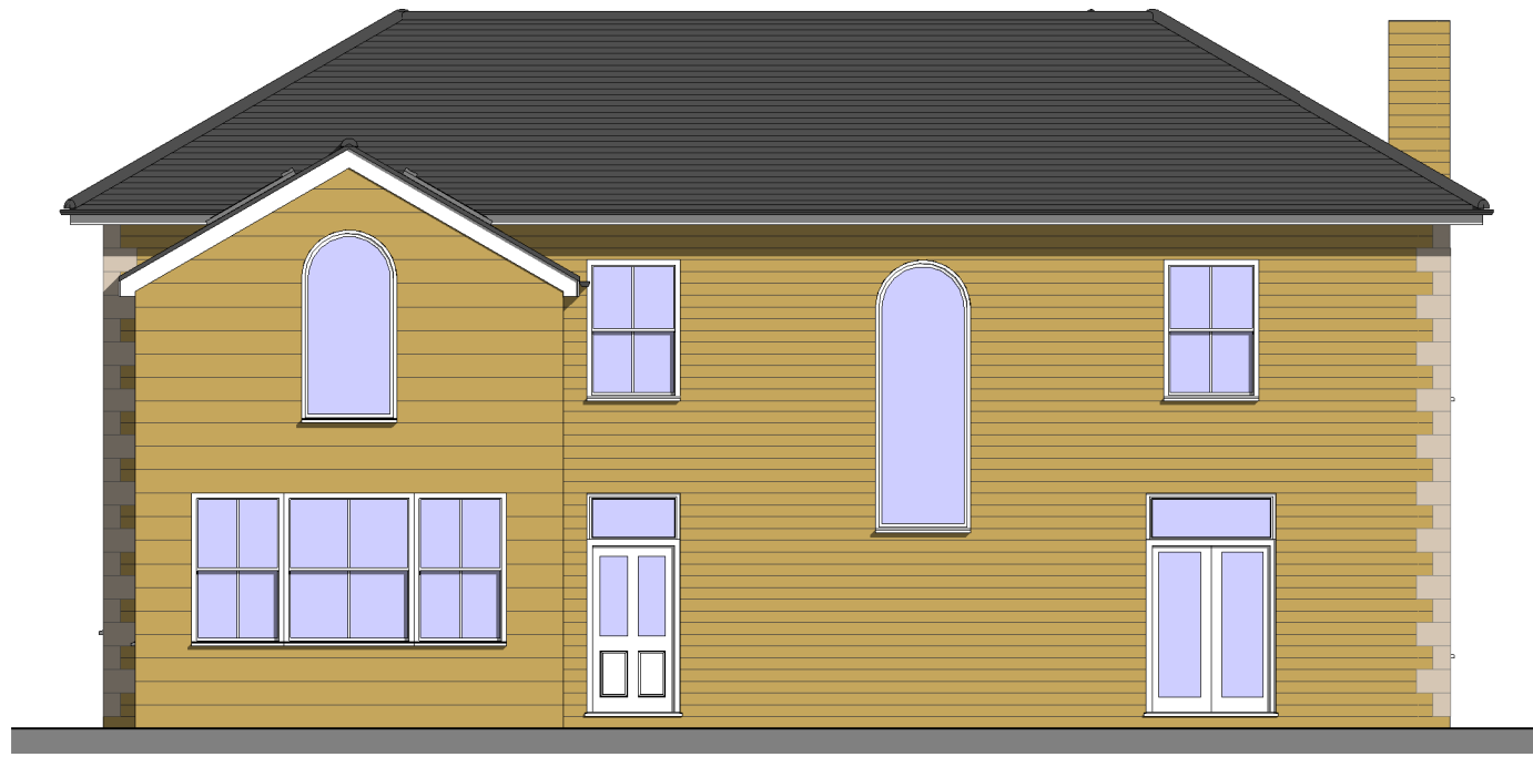
1 Rear Elevation 1:100