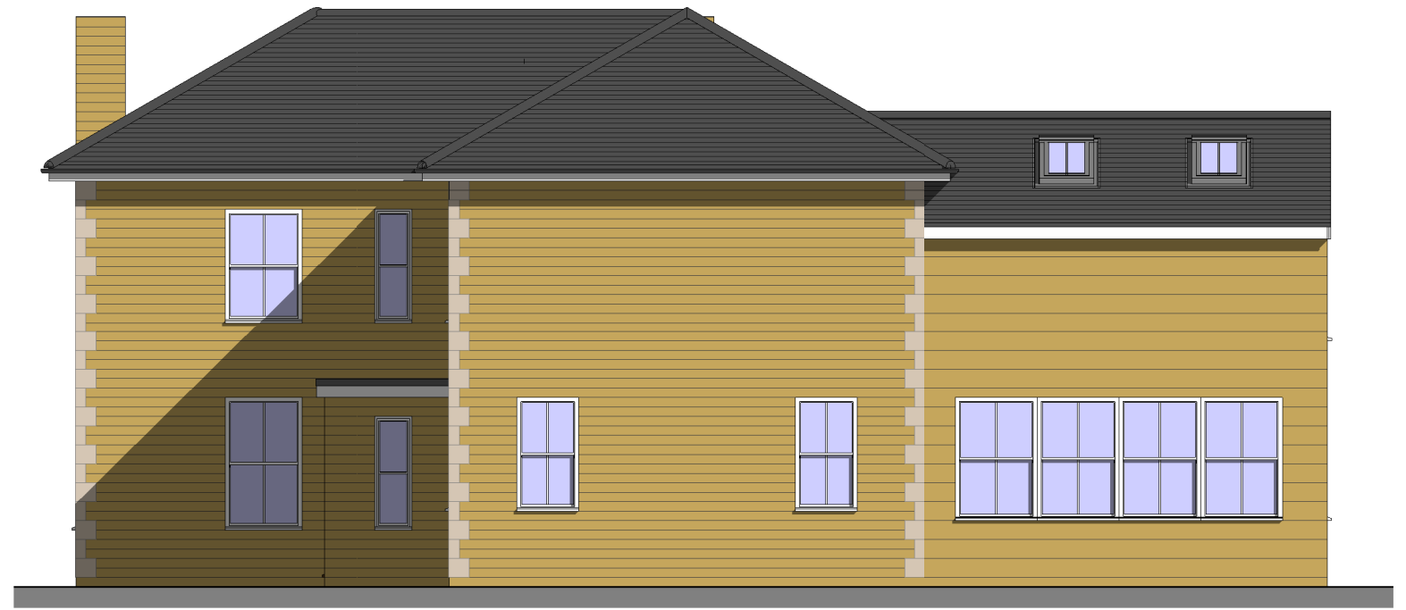
2 LHS Elevation 1:100