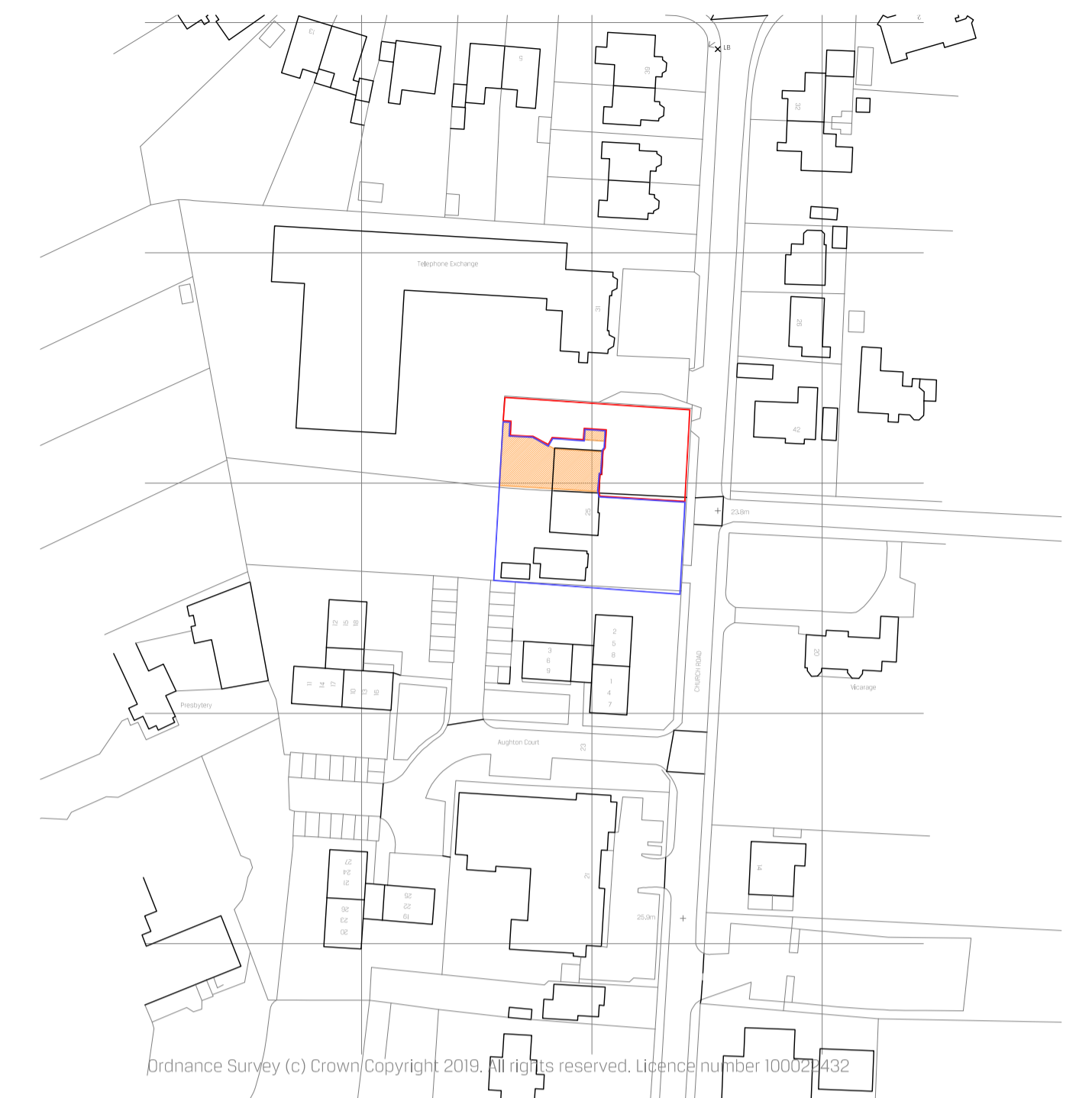
LOCATION PLAN | SCALE 1:1250

Ordnance Survey (c) Crown Copyright 2019. All rights reserved. Licence number 100024832