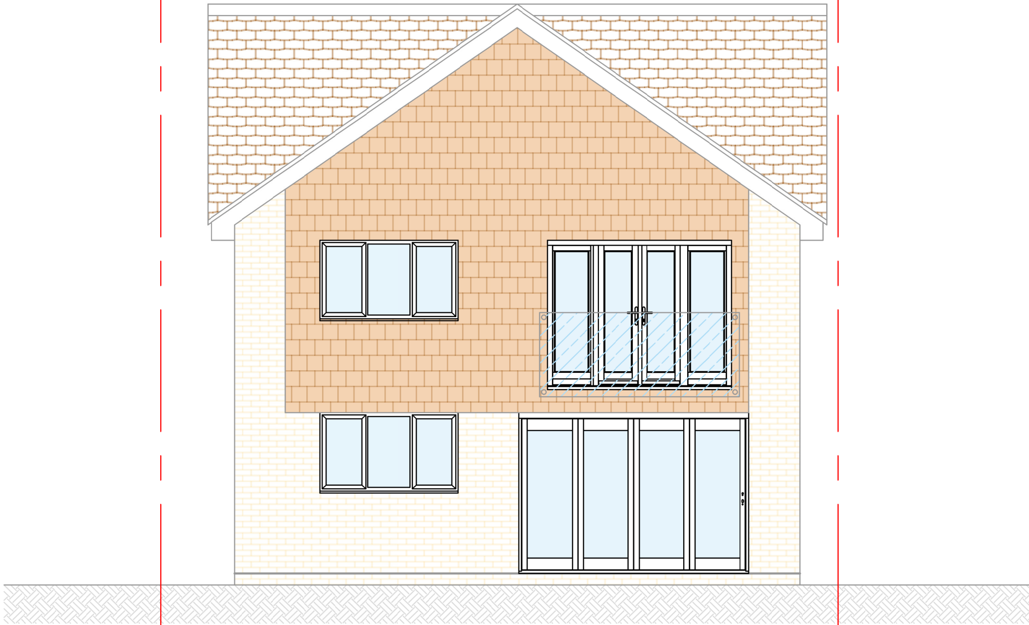
Proposed North Elevation @ 1:50