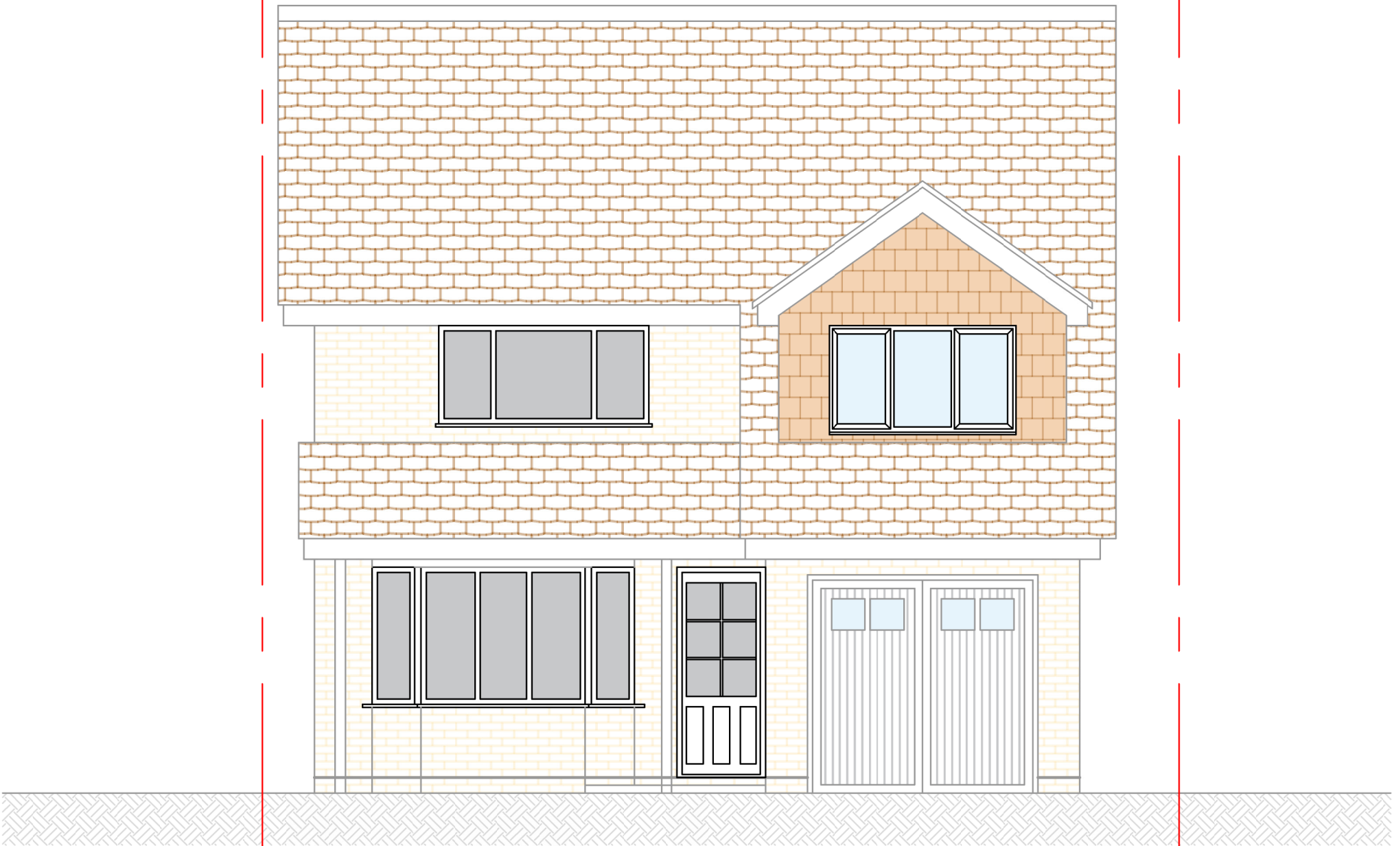
Proposed South Elevation @ 1:50