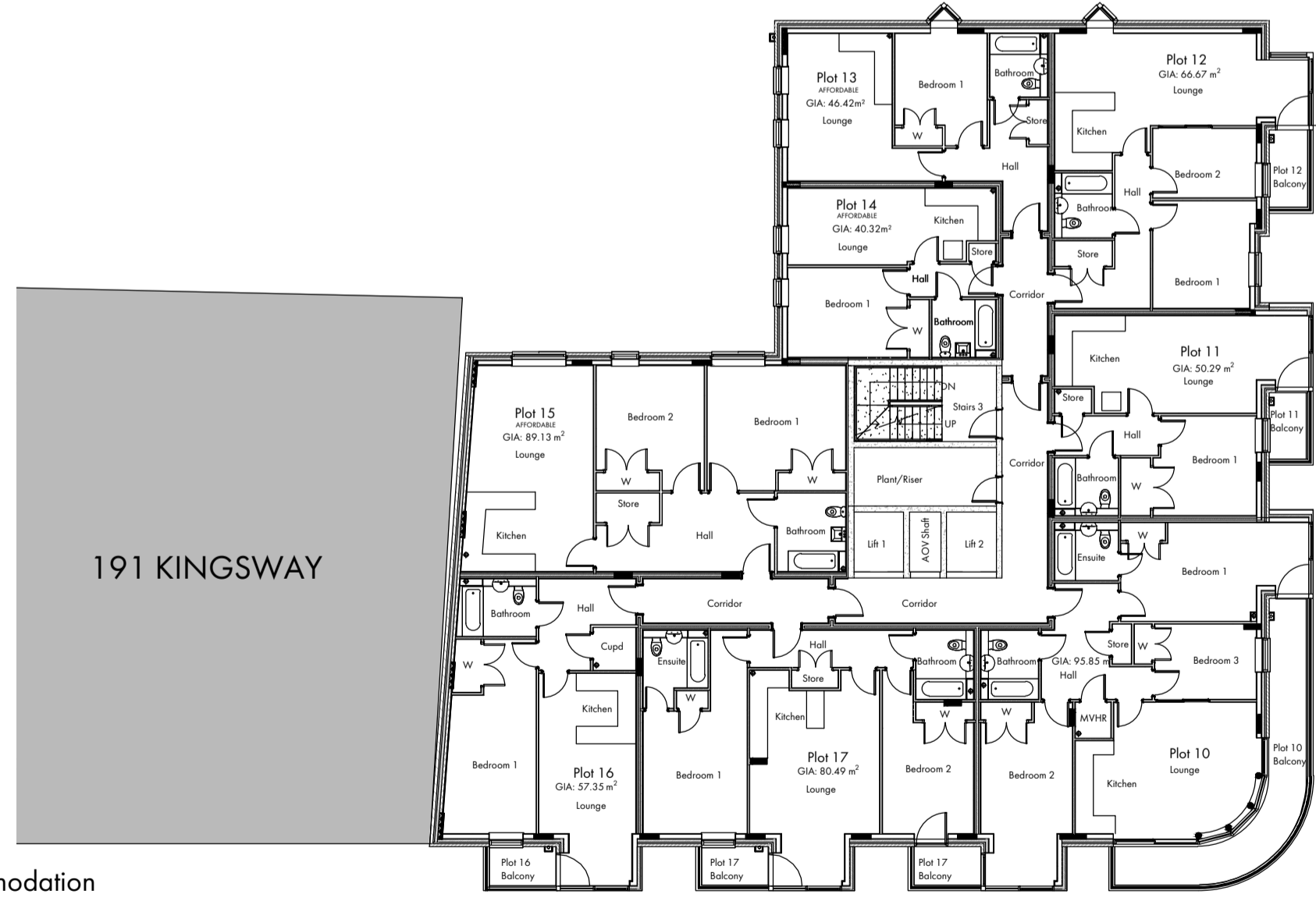
Schedule of Accommodation