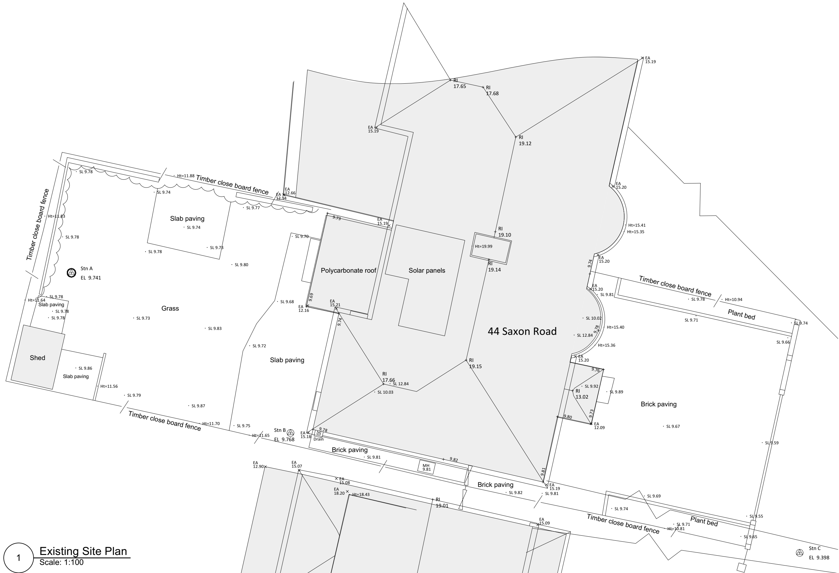
1 Existing Site Plan Scale: 1:100

Disclaimer: This drawing is the copyright of archangels ARCHITECTS Ltd and may not be reproduced or used except by written permission.