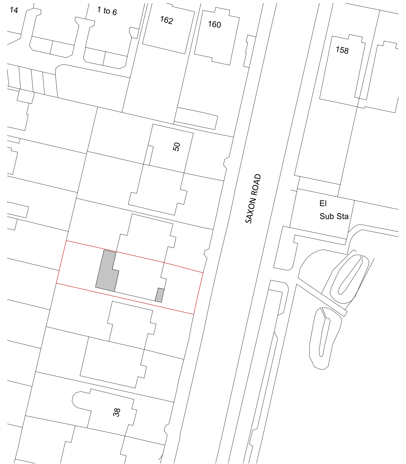
1 Block Plan Scale: 1:500