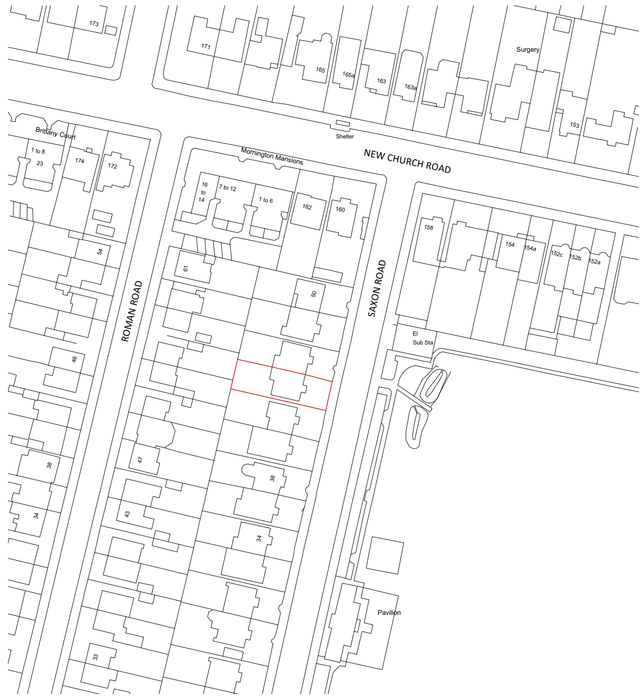
1 Location Plan Scale: 1:1250