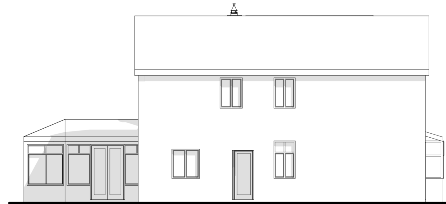
Side Elevation 1:100