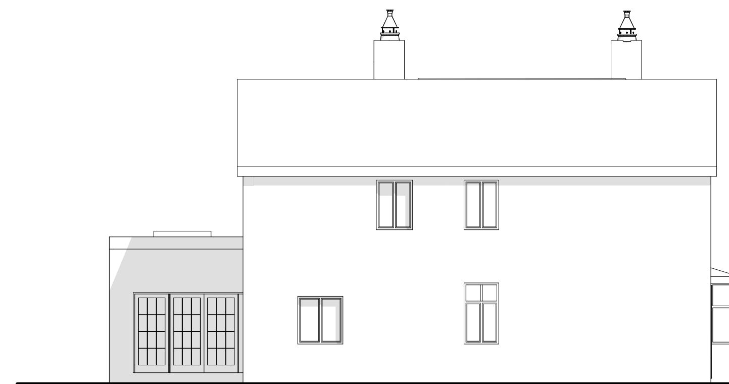
1. Side Elevation 1:100