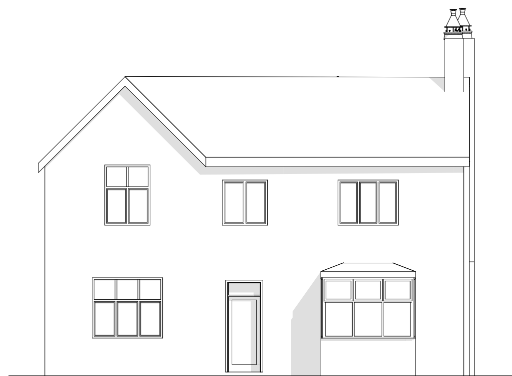
2. Front Elevation 1:100