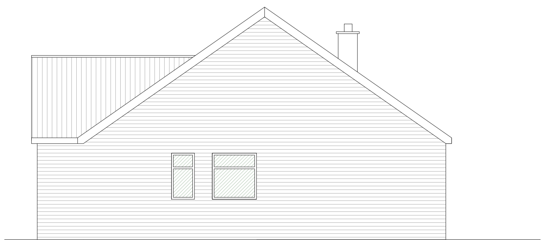
2 Existing Side Elevation 1:50