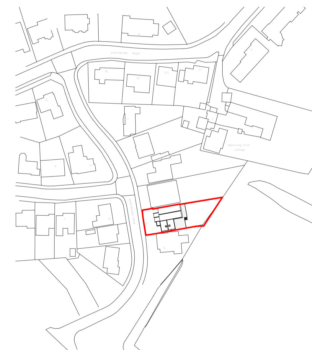
Existing - Site Location Plan Scale: 1 : 1250