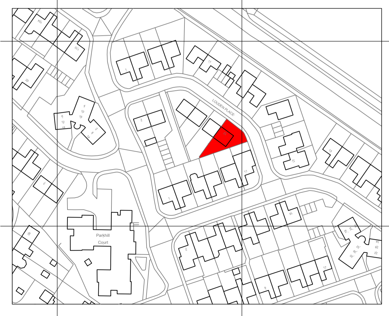
Location Plan Scale 1:1250 0m 20m 40m 60m 80m 100m