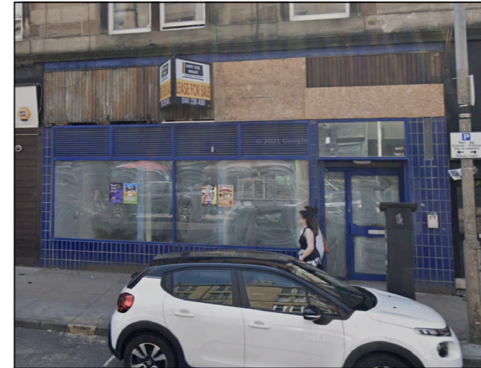
Photo - 195 Great Western Road - As Current