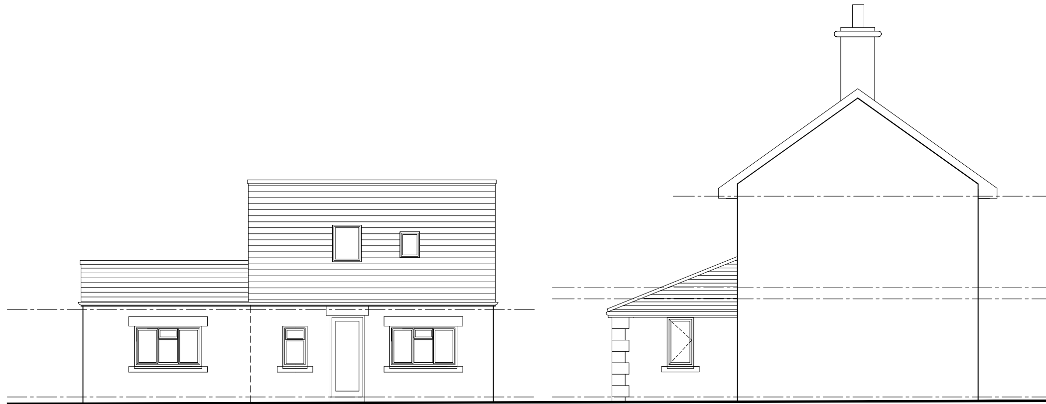
South facing elevation existing