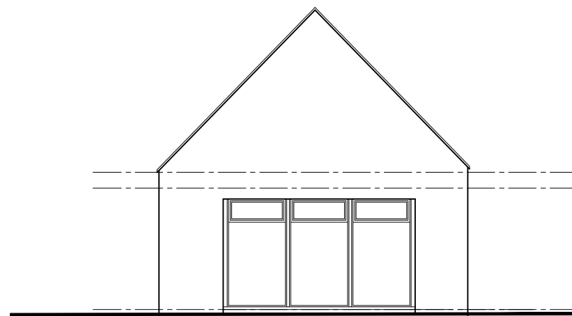
East facing elevation existing