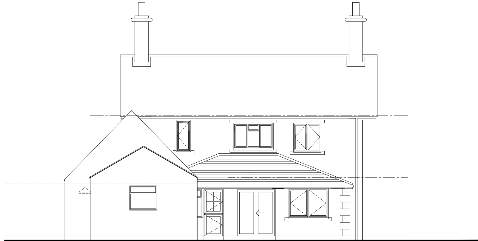
West facing elevation existing